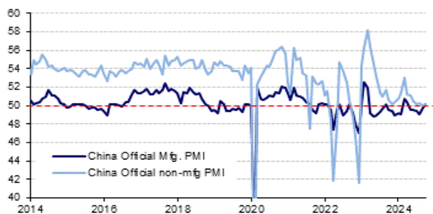
<China mfg. PMI returned to above 50 mark>

China manufacturing PMI for October surprised to upside, rising to 50.1 (vs. 49.9 expected) from prior 49.8 level, while the non-mfg. PMI climbed to 50.2 (vs. 50.3 expected) from 50.0 level due to increasing business activities in the long holiday. Notably, the mfg. PMI recovered to above 50 expansion mark for the first time since April. Looking at the mfg. PMI breakdown, the sub-indices of Output and raw material led gains by +0.8ppt and +0.5ppt to 52 and 48.2, respectively. However, new export order dropped by -0.2ppt to 47.3, indicating weakening external demand amid the global easing cycle. The size breakdown showed mfg. PMI for large and medium enterprises rose by 0.9ppt and 0.2ppt to 51.5 and 49.4, respectively. However, small enterprises recorded 1ppt decline to 47.5. That said, large and medium enterprises received a boost from new stimulus measures, but small enterprises remained struggling in the economic downturn.