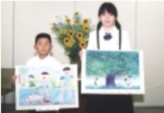
Winners of Mizuho's Environmental Art Contest.

As part of the group's annual “Yellow Badge Traffic Safety Campaign,” we provide first graders throughout Japan with yellow badges that, when worn, signify they are automatically covered by traffic accident insurance. 2004 marks the 40th year of this campaign, which started in 1965, and is sponsored by MHFG, Sompo Japan Insurance, The Meiji Yasuda Life Insurance Company and The Dai-ichi Mutual Life Insurance Company. The campaign has now provided insurance coverage for a total of approximately 50 million children in Japan.