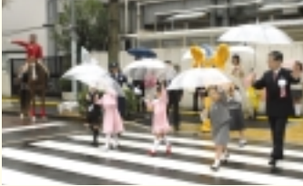
First graders taking part in Yellow Badge Traffic Safety Campaign activities.

To fulfill our role as a “good corporate citizen” in local communities, we have adopted a proactive policy of contributing to society in five areas laid down by our guidelines: (1) nurturing young people; (2) supporting social welfare; (3) promoting the arts, culture and academic studies; (4) assisting international exchange; and (5) endorsing global environmental preservation.