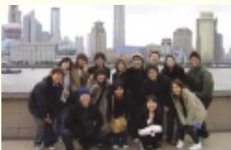
China study tour.