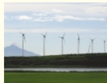
Wind power generators at Teshio River in Hokkaido.

▶ CDM/JI: The mechanism for the greenhouse gas emission reduction project adopted under the Kyoto Protocol.