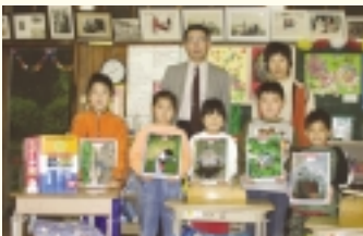
Donation of children's books to elementary schools in rural areas.

In August 2002, we established the Mizuho Charity Fund as a fund collection method to promote community activities by the group's staff. Contributions in units of ¥100 are collected directly from Mizuho employees' monthly salaries and donated to group philanthropic foundations to purchase vehicles to be presented to welfare facilities, used as relief funds during large-scale disasters and contributed to volunteer organizations selected from groups recommended by employees.