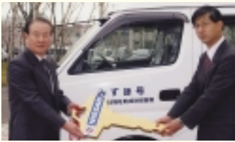
Presentation of vehicle for use by a welfare facility.

Since 1996, we have supported the “All-Japan Elementary and Junior High School Students' Environmental Art Contest,” which promotes environmental education among elementary and junior high school students. Winners are commended and presented with books containing the winning entries.