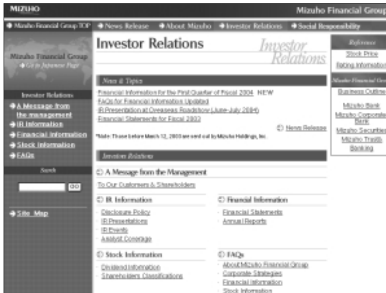
Mizuho's IR Home Page