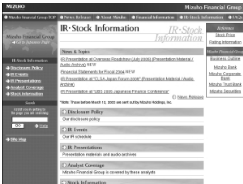
Mizuho's IR Home Page

In accordance with the provisions of the Japanese Banking Law, the Securities and Exchange Law and the relevant regulations laid down by stock exchanges in Japan and around the world, we will endeavor to disclose pertinent information in a timely and appropriate manner.