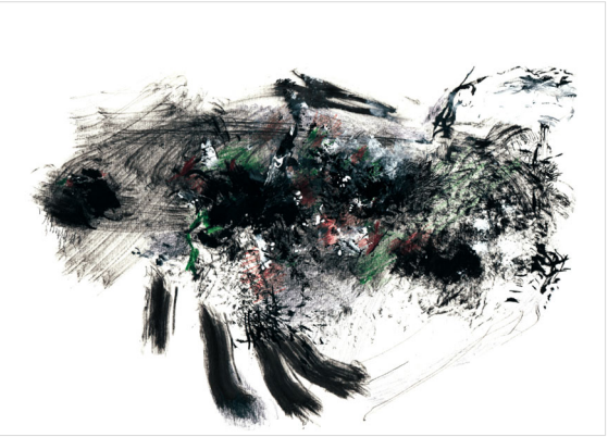
"Spreading roots", the work featured on the IR materials